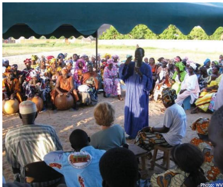
A local Imam encourages his community to practice healthy timing and spacing of pregnancies.