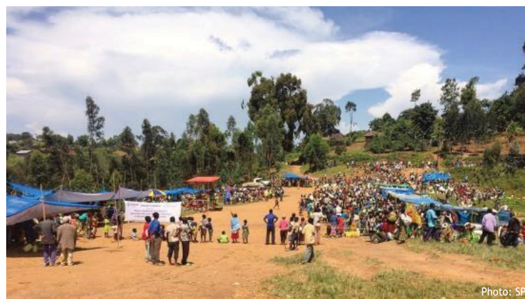
Samaritan's Purse Voucher Fair in Eastern DRC.

Provision of food and non-food items was conducted through a combination of direct distributions and voucher fairs. Items were directly distributed in areas with high levels of insecurity and/or poor infrastructure that resulted in limited market access. Cash-based voucher fairs were utilized in areas with secure, accessible, and integrated markets. Local vendors gathered at voucher fair sites, providing locally preferred produce and non-food items to beneficiaries.