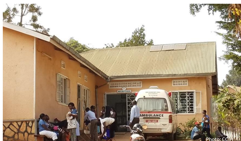
St. Stephen's Hospital in Kampala, Uganda.

This activity was part of a larger program to advance and support community programs that seek to improve the overall health of communities, especially in relationship to family planning. The activity prepared local leaders, including religious and community leaders, to discuss and promote healthy timing and spacing of pregnancies (HTSP) and to ensure women are receiving access to quality family planning (FP) information and services from faith entities. As part of the project, the Uganda Protestant Medical Bureau (UPMB), with support from CCIH, brought together more than 40 local leaders, and Ugandan government officials in Kampala, Uganda for a two-day meeting on the role of faith leaders in promoting healthy families and family planning. Discussions included the identification of family planning methods available, where to receive them, and support to improve couples' communication around family care and wellbeing.