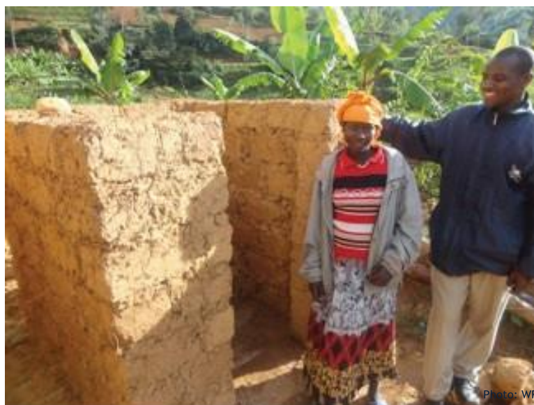
A pastor explaining the construction of a latrine with one of the members of his community. He explains that “building a latrine is not an easy task.”

In focus group discussions with the Kigeme and Kaduha Hospital Directors, Nutritionists, and Community Health Supervisors, all affirmed that the informational role of religious leaders was very important as they shared key messages through churches, were trusted in the community and knew the needs of the people.