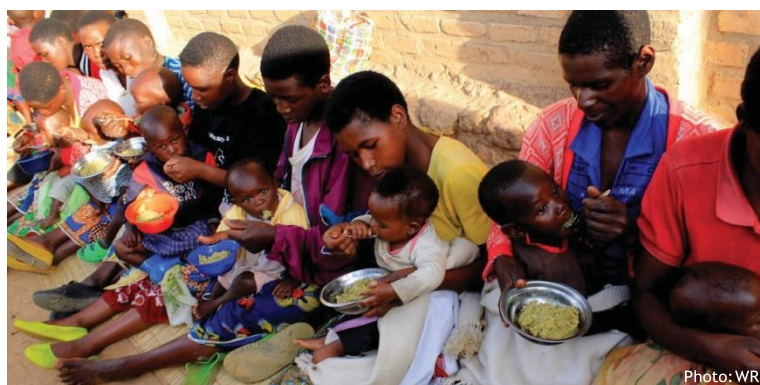
Mothers and fathers feeding their children during a Nutrition Week training in Nyamagabe District, Rwanda.