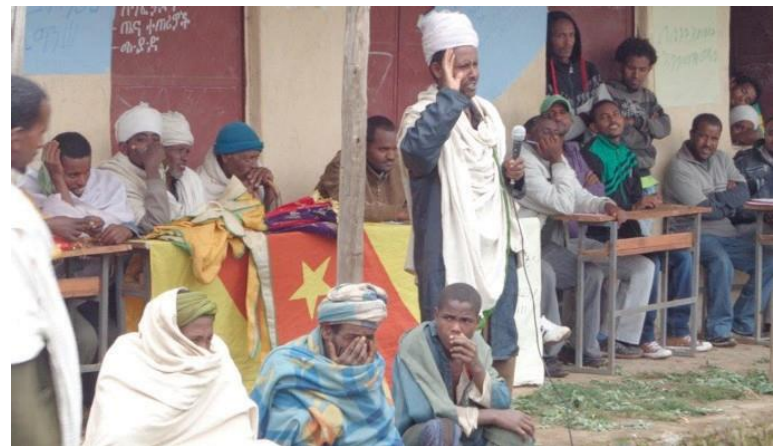
A priest gives opening remarks on the declaration of an ODF zone.

Ethiopia has seen progress in the sanitation and hygiene sector during the past ten years, much of it achieved through the Government's Health Extension Program. As part of the project, Food for the Hungry (FH) engaged local religious and community leaders to help sensitize and construct public latrines for the declaration of 'Open Defecation Free' (ODF) zones. For example, Food for the Hungry (FH) worked with Orthodox Church priests to reach out to their congregations on the importance of sanitation and hygiene. This resulted in the building of public toilets and the declaration of ODF zones.