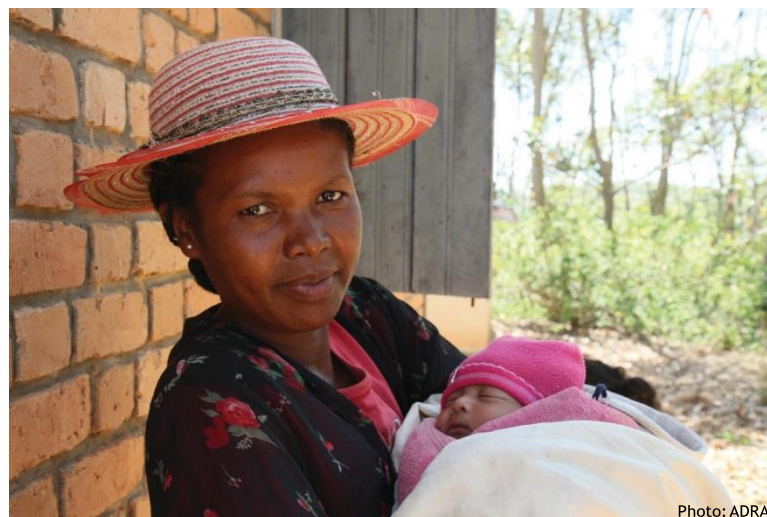
ASOTRY beneficiary in Madagascar.

1) Improved Health and Nutrition—Core to the root of health and nutrition problems is behavior, which is influenced directly by knowledge and resource availability. ADRA focuses on nutrition for women of reproductive age and children under two,