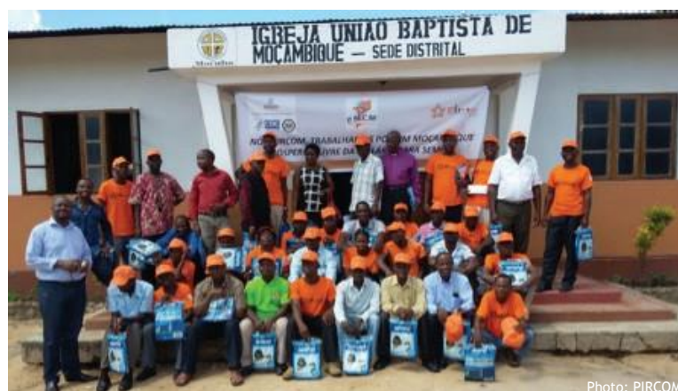
PIRCOM trainees outside a church building after training.

The prestige of religious leaders in the community has greatly increased the efficacy of this project. Their influence leads to greater compliance among the communities for the messages that they promote on malaria prevention and treatment. Likewise, community health workers are considered key actors in the community as they extend primary health care to local communities, particularly in rural areas. The fact that churches are dispersed across the country, including in some of the most remote regions, has enhanced the access of the project to a wider, and frequently under-served, population. Finally, this project has reinforced collaboration and cooperation between local faith communities, their leaders, and health care at all levels. As crucial local actors, such collaborations are essential for effective health promotion and mutually reinforce these actors' roles in the community.