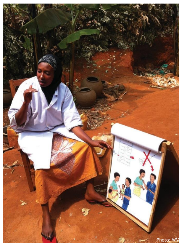
A Muslim midwife explains contraceptive choices.