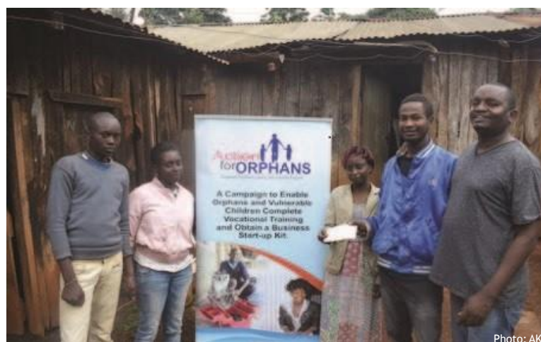
Yetu partner St. Joseph's CSO "Action for Orphans" campaign beneficiaries from Karatina Town, Nyeri County, Kenya

USAID Contribution: $2.9 million; Other Funders' Contribution: $3 million