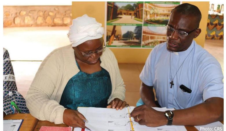
Members of a local religious organization plan their context assessment during the CIPP Social Cohesion Community of Practice Launch Workshop.

USAID contribution: $3.5 million; Other Funders' Contribution: $6.5 million