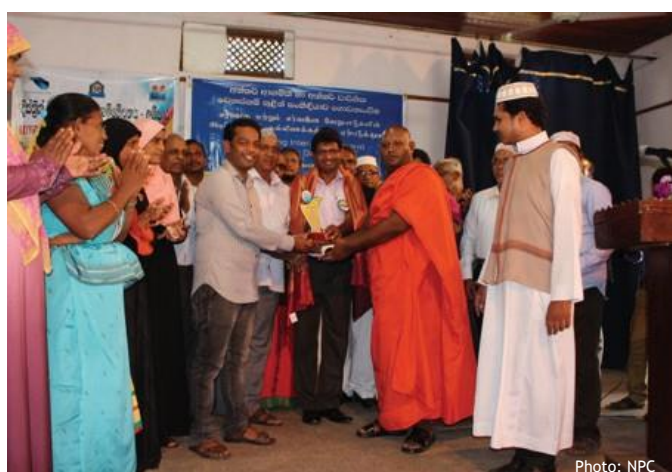
Celebration of diversity and unity with local religious leaders.

In a sign of the National Peace Council's successful work with DIRCs, the government has validated the formation of government-led inter-religious reconciliation committees in all districts of the country. As of June 2017, approval has been granted for the Establishment of District-Level Reconciliation Committees in all 25 districts.