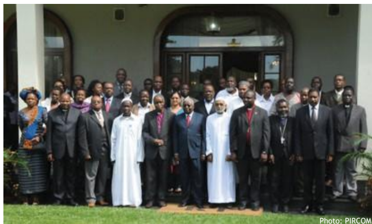
President of the Republic of Mozambique with religious leaders from PIRCOM in 2012 at the African Leaders Malaria Alliance.

Current project activities include training of trainers with faith leaders; training of faith leaders and lay activists to serve as community health volunteers; dissemination of key messages related to malaria prevention and treatment through faith leaders and volunteers at district and community level; use of community radio by faith leaders to strengthen community mobilization for prevention and treatment of malaria; leveraging mass media (national television and radio, public meetings, newspapers) for PIRCOM leadership to advocate and disseminate key messages on malaria prevention.