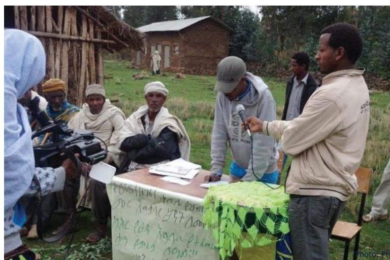
A Kebele (ward) leader declares an ODF zone with local religious leaders to his right

Handing over treated watersheds to user groups and tying management and safeguarding of community assets with economic benefits yielded impressive results. It helped those who take care of the community resources earn money through selling of grasses, trees and engaging in beekeeping while at the same time sustainably managing community resources.