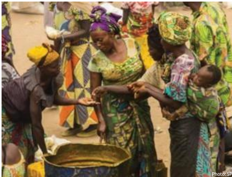
Samaritan's Purse Livestock Training and Support in Eastern DRC.

SP established high standards and practices in order to guarantee there was no religious bias in the involvement of local FBOs. SP worked with them alongside other community leaders and opinion leaders in an open and transparent manner. Since project activities were aimed at vulnerable households, beneficiary targeting was based purely on vulnerability criteria.