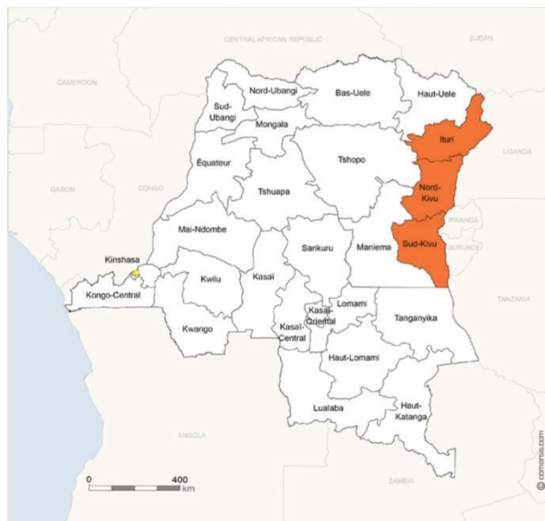
Map of USHINDI-assisted Health Zones in Eastern DRC.

The strength of Ushindi is strongly linked to community participation and ownership. Ushindi's flexible and comprehensive model, which addresses a wide range of survivor needs, among both women and men, helps the project reach more beneficiaries than a project that offers a single intervention. Further research to better understand the relative contribution of different interventions to the recovery of survivors in a conflict/post-conflict setting would further guide future program activities and resource mobilization.