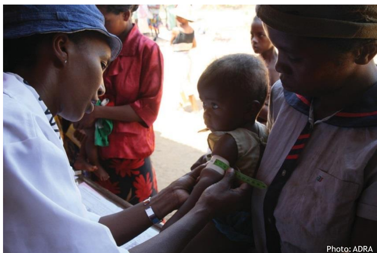
A community health worker screening children for malnutrition.

Throughout Madagascar, religious and community leaders are well-respected and influencers of behaviors. ASOTRY regularly engages them to share announcements with their communities related to maternal and child health activities; practicing and promoting proper hygiene behaviors, such as handwashing and using soap or ash; sensitizing communities on the benefits of constructing covered latrines; and promoting local contributions to constructing and maintaining infrastructure, such as storage facilities. Additionally, faith and community leaders are sometimes “Village Agents,” responsible for training new VSL groups or promoting farmer field schools and FBAs.