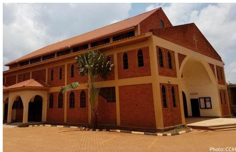
St. Apollo church in Kampala, Uganda.

Faith communities may benefit from having full information about the available methods of family planning and should be free to decide what contraceptive method, if any, may be right for them. When they are in a comfortable environment with their peers, religious leaders are very open to discussing family planning and learning about its potential benefits. Religious and community leaders' knowledge about family planning can be increased through training sessions and realistic simulation exercises.