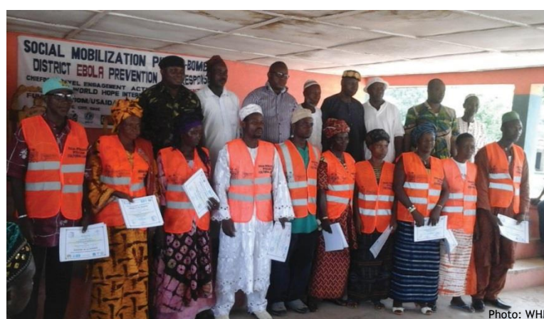
Cultural Liaisons Presentation and Certification at Gbendembu Ngowahun Chiefdom.

CBLs were identified by religious and traditional leaders as persons who would be able to assist with